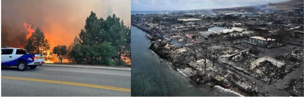
Left: Trees burning in the Gray Fire in Eastern Washington; Right: Aerial photo of the damage to Lahaina, Maui